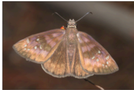
Fig. 29. Ephyiades brunnea floridensis , female, FLORIDA: Monroe County: Big Pine Key, nature trail NW of Blue Hole, 14-V-2014.