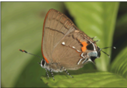
Fig. 21. Electrostrymon angelia angelia , female, FLORIDA: Miami-Dade County: Castellow Hammock Park, NE of Homestead, 13-V-2014.