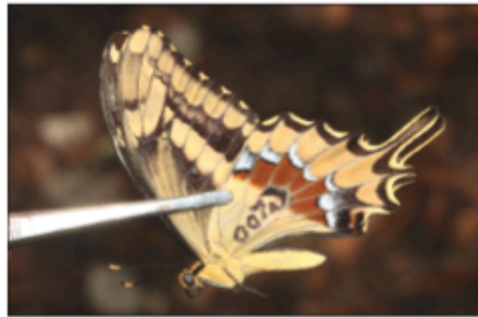
Fig. 4. Heraclides aristodemus ponceanus , marked male ventral, FLORIDA: Miami-Dade County: Elliott Key, Biscayne National Park, 10-V-2014.