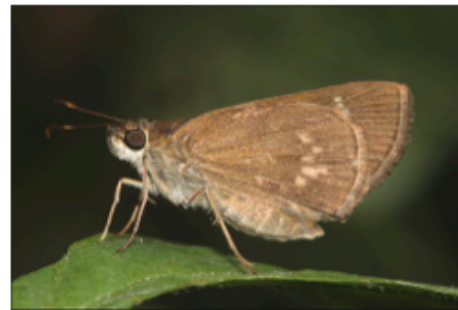
Fig. 22. Cymaenes tripunctus tripunctus , female, FLORIDA: Miami-Dade County: Castellow Hammock Park, NE of Homestead, 13-V-2014.