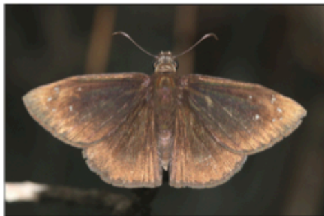
Fig. 28. Ephyiades brunnea floridensis , male, FLORIDA: Monroe County: Big Pine Key, vic. Blue Hole, 14-V-2014.

capucinus , Fig. 31), a probable male Yellow Angled-sulphur ( Anteos maerula ), and 3 female Lyside Sulphurs ( Kricogonia lyside , Fig. 32), one of which was ovipositing on Guaiacum officinale , representing a new foodplant record for Florida (see discussion below). After overstaying my welcome (I didn't notice the sign announcing the 4:00 pm closing time on my way in), I started the trip back to Homestead at about 4:40 pm, stopping only briefly at Long Key State Park, where no butterflies were seen.