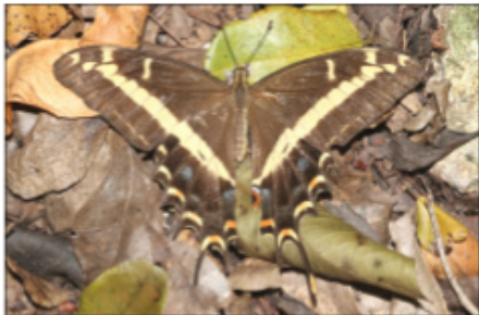
Fig. 11. Heraclides andraemon , female dorsal, FLORIDA: Miami-Dade County: Elliott Key, Biscayne National Park, 11-V-2014. [Figs. 11 (d) and 12 (v) are the same specimen.]