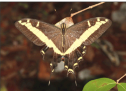
Fig. 7. Heraclides andraemon , male dorsal, FLORIDA: Miami-Dade County: Elliott Key, Biscayne National Park, 10-V-2014. [Figs. 7 (d) and 8 (v) are the same specimen.]