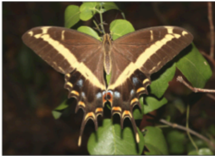
Fig. 9. Heraclides andraemon , female dorsal, FLORIDA: Miami-Dade County: Elliott Key, Biscayne National Park, 11-V-2014. [Figs. 9 (d) and 10 (v) are the same specimen.]