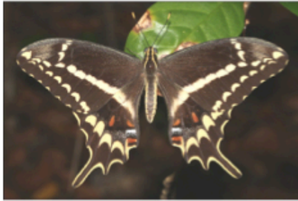
Fig. 1. Heraclides aristodemus ponceanus , male dorsal, FLORIDA: Miami-Dade County: Elliott Key, Biscayne National Park, 11-V-2014.