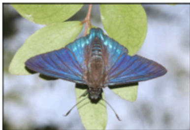
Fig. 15. Phocides pigmalion okeechobee , male, FLORIDA: Monroe County: Key West Tropical Forest and Botanical Garden, Stock Island, 14-V-2014.