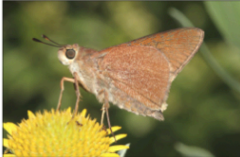
Fig. 31. Asbolis capucinus , male, FLORIDA: Monroe County: Key West Tropical Forest and Botanical Garden, Stock Island, 14-V-2014.