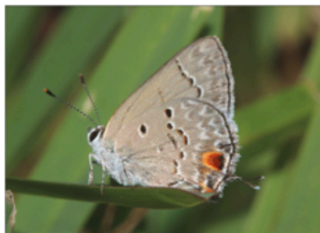
Fig. 35. Strymon istapa modesta , female, FLORIDA: Miami-Dade County: Camp Owaissa Bauer, N of Homestead, 13-V-2014.