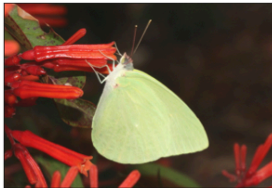
Fig. 26. Aphrissa neleis , male ventral, FLORIDA: Miami-Dade County: Modello Wayside Park, N of Homestead, 13-V-2014.

After a relatively successful day of butterfly photography the day before, and a second night of delicious Mexican food in Homestead, I headed into the Florida Keys on May 14 th . The goal was to reach Key West, and see all the habitats between there and Homestead, even if it meant not stopping much along the way. The first half of the trip was very windy, with scattered rain showers, but by the time I reached Big Pine Key it was sunny. I headed straight to the nature trails just northwest of Blue Hole, and was happy to find the Florida Duskywing ( Ephyriades brunnea floridensis ) in great abundance, with several dozen adults of both