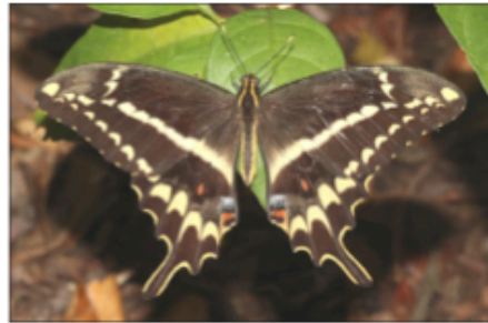
Fig. 2. Heraclides aristodemus ponceanus , male dorsal, FLORIDA: Miami-Dade County: Elliott Key, Biscayne National Park, 10-V-2014.