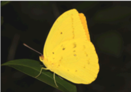
Fig. 19. Phoebis agarithe maxima , male, FLORIDA: Miami-Dade County: Camp Owaissa Bauer, N of Homestead, 13-V-2014.