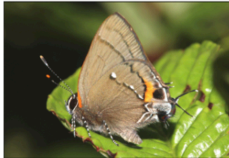
Fig. 20. Electrostrymon angelia angelia , male, FLORIDA: Miami-Dade County: Castellow Hammock Park, NE of Homestead, 13-V-2014.