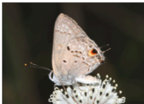
Fig. 34. Strymon istapa modesta , male, FLORIDA: Monroe County: Key West Tropical Forest and Botanical Garden, Stock Island, 14-V-2014.

Gainesville after five excellent days in the field. Surely, this was not my last trip to South Florida for butterflies, but I did come away feeling somewhat discouraged by the low numbers of butterflies seen in most areas, and the paucity of remaining habitats.