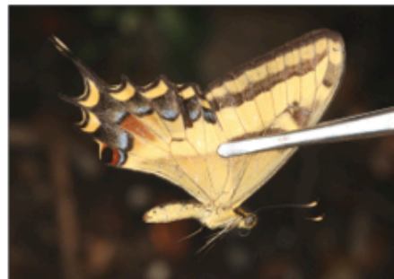
Fig. 8. Heraclides andraemon , male ventral, FLORIDA: Miami-Dade County: Elliott Key, Biscayne National Park, 10-V-2014. [Figs. 7 (d) and 8 (v) are the same specimen.]