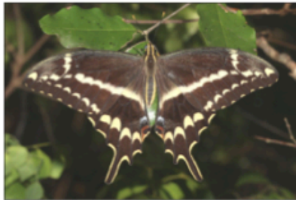
Fig. 3. Heraclides aristodemus ponceanus , male dorsal, FLORIDA: Miami-Dade County: Elliott Key, Biscayne National Park, 11-V-2014.