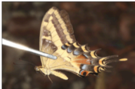
Fig. 12. Heraclides andraemon , female ventral, FLORIDA: Miami-Dade County: Elliott Key, Biscayne National Park, 11-V-2014. [Figs. 11 (d) and 12 (v) are the same specimen.]