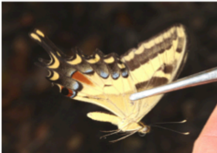
Fig. 6. Heraclides andraemon , male ventral, FLORIDA: Miami-Dade County: Elliott Key, Biscayne National Park, 9-V-2014. [Figs. 5 (d) and 6 (v) are the same specimen.]