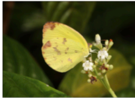
Fig. 18. Pyrisitia dina helios , female, FLORIDA: Miami-Dade County: Camp Owaissa Bauer, N of Homestead, 13-V-2014.