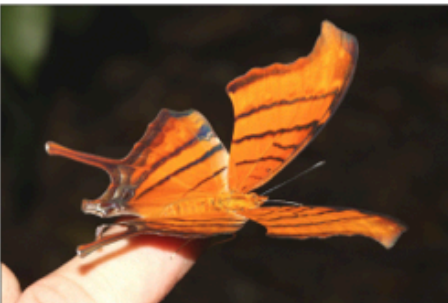
Fig. 23. Marpesia petreus , female dorsal, FLORIDA: Miami-Dade County: Castellow Hammock Park, NE of Homestead, 13-V-2014.