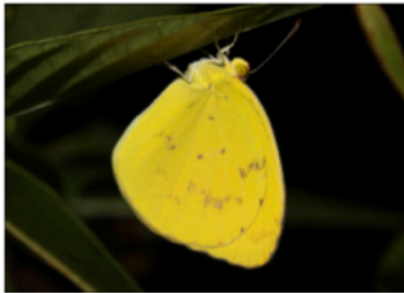
Fig. 17. Pyrisitia dina helios , male, FLORIDA: Miami-Dade County: Camp Owaissa Bauer, N of Homestead, 13-V-2014.