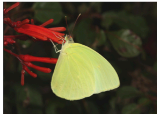
Fig. 27. Aphrissa statira floridensis , male ventral, FLORIDA: Miami-Dade County: Modello Wayside Park, N of Homestead, 13-V-2014.

sexes present, and several females ovipositing on the larval foodplant Brysonima lucida ; various adults were surprisingly sedentary and allowed close-up photography for extended periods of time (Figs. 28-29). Few other butterflies were seen there or around Blue Hole, so I