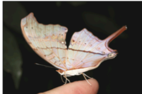
Fig. 24. Marpesia petreus , female ventral, FLORIDA: Miami-Dade County: Castellow Hammock Park, NE of Homestead, 13-V-2014.