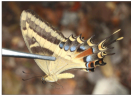
Fig. 10. Heraclides andraemon , female ventral, FLORIDA: Miami-Dade County: Elliott Key, Biscayne National Park, 11-V-2014. [Figs. 9 (d) and 10 (v) are the same specimen.]