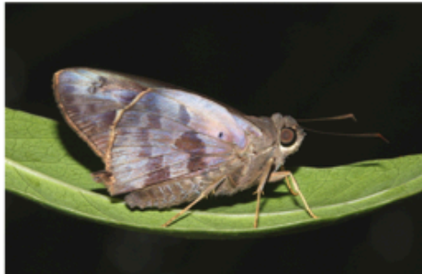
Fig. 30. Polygonus leo histrio , male, FLORIDA: Monroe County: Key West Tropical Forest and Botanical Garden, Stock Island, 14-V-2014.