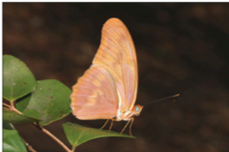
Fig. 33. Dryas iulia largo , male, FLORIDA: Miami-Dade County: Elliott Key, Biscayne National Park, 11-V-2014.