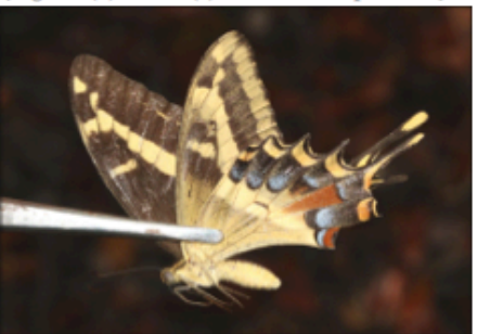
Fig. 13. Heraclides andraemon , female ventral, FLORIDA: Miami-Dade County: Elliott Key, Biscayne National Park, 9-V-2014. [Figs. 13 and 14 are the 3 rd and 4 th female specimens, that I couldn't get dorsal shots of.]