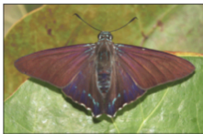
Fig. 16. Phocides pigmalion okeechobee , female, FLORIDA: Monroe County: Key West Tropical Forest and Botanical Garden, Stock Island, 14-V-2014.