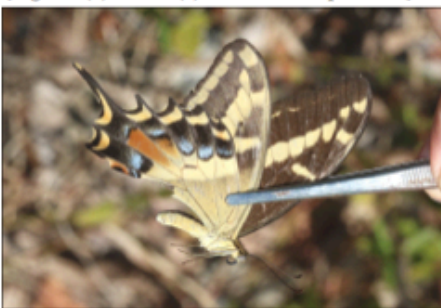
Fig. 14. Heraclides andraemon , female ventral, FLORIDA: Miami-Dade County: Elliott Key, Biscayne National Park, 9-V-2014. [Figs. 13 and 14 are the 3 rd and 4 th female specimens, that I couldn't get dorsal shots of.]