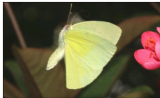
Fig. 25. Aphrissa neleis , male dorsal, FLORIDA: Miami-Dade County: Modello Wayside Park, N of Homestead, 13-V-2014.

It was almost 3:00 pm when I left Castellow Hammock, and I needed a break from the heat, so I drove down to Navy Wells Pineland Preserve, east of Homestead. The Preserve consists of some very nice-looking pineland habitat, but conditions were very dry. Essentially no nectar sources were found, thus, very few butterflies were observed, and most of those were seen from the car. After declaring the site unproductive, I decided that I probably had time for one or two more stops, so I headed to a nearby site I'd never heard mentioned before, Fuchs Hammock Preserve. This tiny preserve is located north of SW 304 th St., between SW 197 th and SW 202 nd Ave., northwest of Homestead, and as I learned, is completely fenced off and inaccessible. Upon asking a neighbor about access to the park, he said there is no public access, and that in 15 years of living right next to the park, he had never been inside. So I headed back towards Homestead, and made one last stop at Modello Wayside Park. This is a tiny park at the southwest corner of the junction of SW 288 th St. and US Hwy. 1, consisting of a lawn and about 70-80 trees sandwiched between busy streets. Fortunately, about half of the trees in the park are Lysiloma sabicu , and in the back (southwest) corner of the park are 5 large flowering